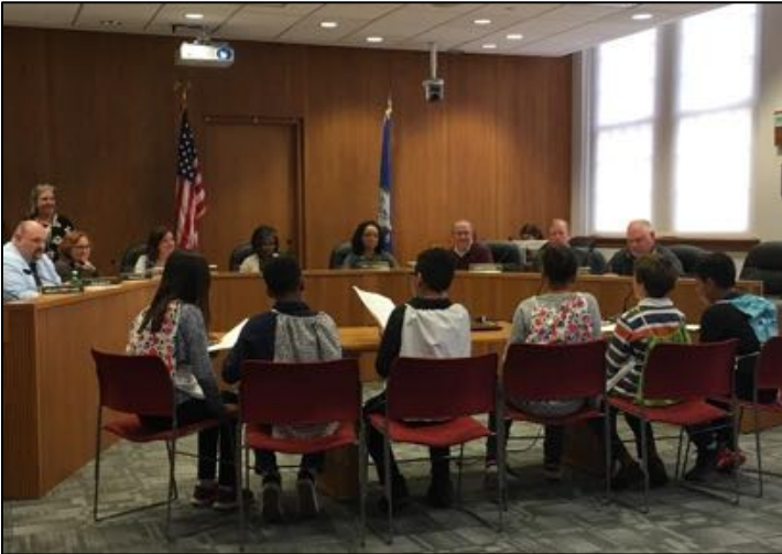
Charter Oak students sharing results of their waste audit and sustainability efforts to the West Hartford Board of Education, including news of receiving RecycleCT Innovation Grant.