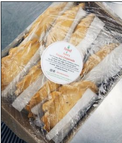
Nora's Potato Empanadas, product from FEED Center.