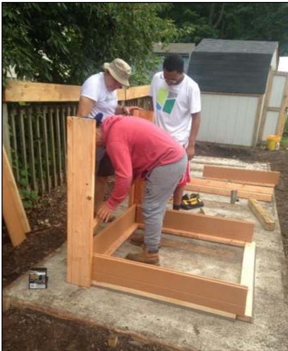
High School students from New Haven, participating in the NHLT Growing Entrepreneurs program, helping build the aerated static compost bin system.