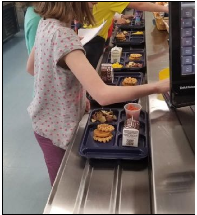
Charter Oak students using their new reusable trays.

Charter Oak International Academy is an international baccalaureate elementary magnet school in West Hartford. Their mission is “to inspire and prepare all students to realize their potential and enhance our global community.” This school is actively focused on environmentalism, is a green LEAF school and considers themselves to have a culture of sustainability.