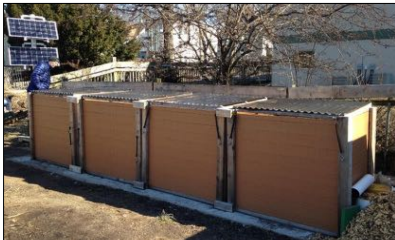
Finished four-bin aerated static compost bin system

In addition to working with community gardeners and students, the Community Compost project expanded or deepened connections with other New Haven organizations; Peels and Wheels for their technical training; Common Ground High School who also recently developed an aerated static pile system to share new ideas and work on problem-solving; Haven's Harvest who recovers edible food for people, but also has food that cannot be eaten and the Downtown Evening Soup Kitchen, who feeds community members and has food scraps from their kitchen.